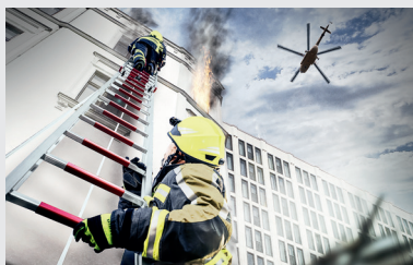
MUNK Rescue Equipment