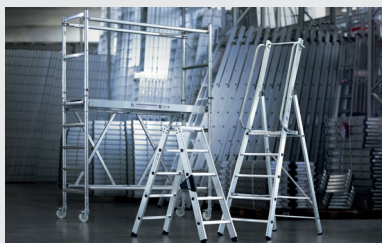
MUNK Access Equipment & Special Constructions

MUNK Günzburger Steigtechnik is a brand of the MUNK Group and is synonymous with premium-quality ladders, mobile scaffoldings and special constructions.